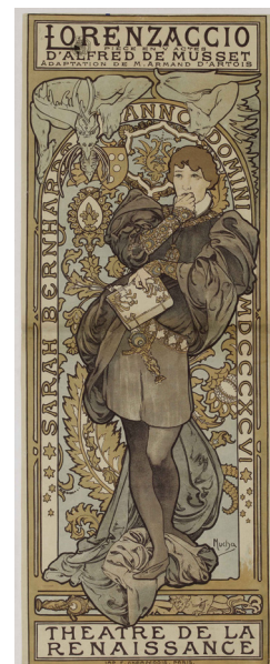
Alphonse Mucha, Lorenzaccio