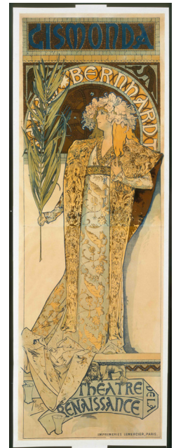
Alphonse Mucha, Gismonda, 1894, colour lithograph, Paris

Sarah Bernhardt interpreted hundreds of roles throughout her career, but some have indelibly marked the collective consciousness. Her repertoire included Racine and Shakespeare, as well as 19th-century authors, like Victor Hugo and Alexandre Dumas fils, author of La Dame aux Camélias , one of her greatest roles. The playwright Victorien Sardou was one of the actress' preferred authors. He wrote tailor-made plays for her, some of which, like Théodora and Tosca , were veritable triumphs, combining historical reconstructions worthy of the peplums of Hollywood cinema with a plot full of twists and an often-tragic ending. The Divine Sarah was especially famous for her "death scenes". A selection of Sarah Bernhardt's most iconic roles is presented in this gallery, so as to evoke, from Tosca to Phèdre , the art of theatre as the actress conceived of it: a total art combining the magic of gesture and voice with sumptuous, historicist staging.