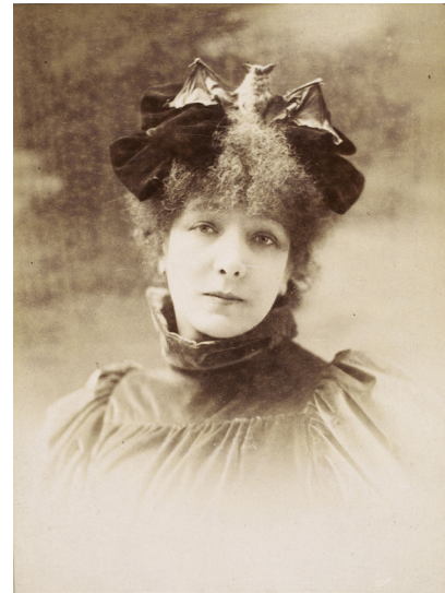
Sarah Bernhardt with a bat hat

As soon as it was published, this photograph caused a lot of people to talk. The origin of this white satin-covered coffin remains a mystery; was it a gift from one of Sarah's lovers, her mother, or did Sarah acquire it to get used to the idea of death? It reveals the morbid character of the actress. When she moved her sister, who was very ill at the time, to her home in the rue de Rome, Sarah gave up her bed and slept in the same room in her little coffin. People began to talk about the strange arrangement and Sarah took advantage of the situation by asking the photographer Mélandri to take a picture. The result was a great success and generated considerable income for both Sarah and the photographer.