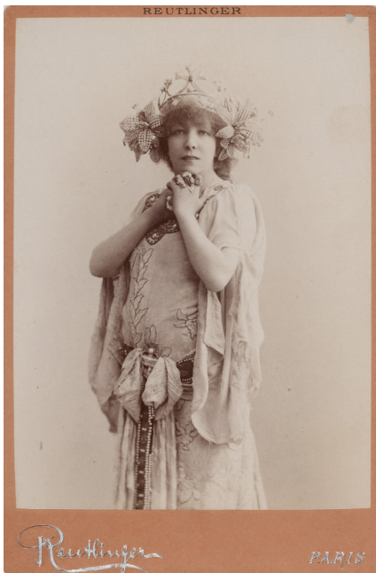
Charles Reutlinger, Sarah Bernhardt as an exotic Princess c.1895, album card © BnF