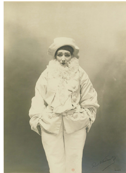
Paul Nadar, Sarah Bernhardt in Pierrot assassin 1883, silver print, Paris

On 28 April 1883, Sarah appeared as Pierrot at the Trocadero theatre with Réjane as Colombine in Richepin's play Pierrot assassin . The macabre pantomime did not last long. It was the photograph by Paul Nadar, the favourite photographer of Parisian theatres, that immortalised Sarah's powdered white face in this role, which was only moderately successful. The image inspired the painter and friend of Sarah, Giuseppe De Nittis. The mime Debureau, photographed by Adrien Nadar, had made the character widely known a few decades earlier.