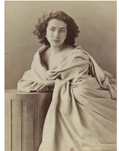
Félix Tournachon, known as Nadar, Sarah Bernhardt draped in white, 1859, BnF, Département des Estampes et de la photographie, Paris, France

After a neglected childhood spent in provincial France, Sarah Bernhardt joined her maternal family in Paris in the late 1850s. Both her mother and aunt were popular and successful courtesans in the capital. Sarah Bernhardt soon became a demi-mondaine in turn. Amongst the important relations of the “seductive Sarah Bernhardt family”, to cite Edmond de Goncourt, we can mention the Duc de Morny, half-brother of Napoleon III. He was responsible for encouraging the young Sarah, who already displayed a rather strong temperament, to enter the Conservatoire. Sarah Bernhardt went on to play various small roles ranging from the classical repertoire to lighter productions. She rose to prominence in 1869 at the Théâtre de l’Odéon in Le Passant by François Coppée, where she played a transvestite. In 1872, she would triumph in this same theatre, in the role of the Queen in Victor Hugo’s Ruy Blas . Her acting career had been launched.