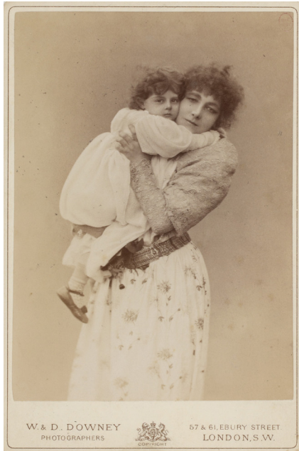
Sarah Bernhardt and her young daughter 1892, album card