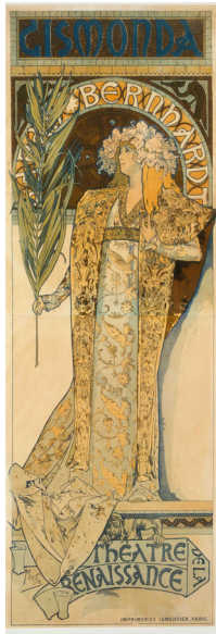
Alphonse Mucha, Gismonda

1894, colour lithograph, BnF, Department of Performing Arts, Paris, France