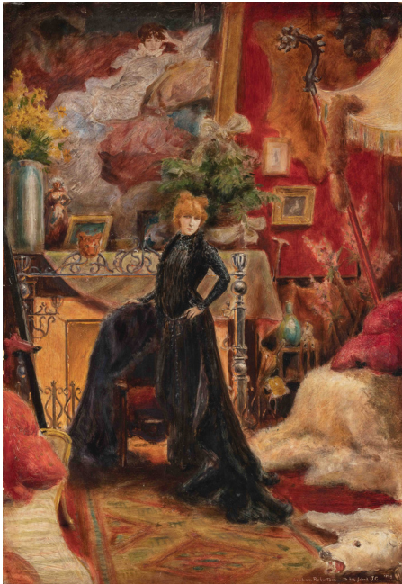
Walford Graham Robertson, The Actress Sarah Bernhardt in her Salon