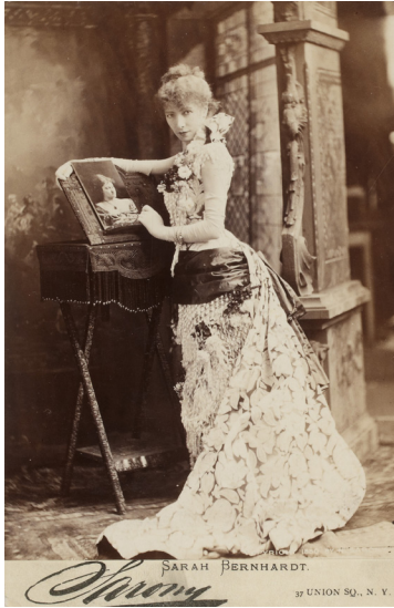
Napoléon Sarony, Sarah Bernhardt in Frou Frou 1880, albumen print, BnF, Département des Arts du spectacle, Paris, France

Canadian-born Napoleon Sarony opened his first studio in New York in 1865. A renowned portraitist, he obtained the exclusive rights to take Sarah's portraits in America by offering her the sum of $1,500. The actress poses in her Frou Frou stage costume, in a setting created in the photographer's studio. Curiously, she is standing in front of a photograph of a young woman placed on a stand. It is not clear if the portrait is one of the photographer's props or whether it had special significance for Sarah.