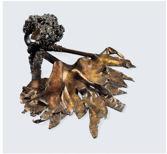
Sarah Bernhardt, Algues 1900, bronze, private collection

During her stays on Belle-Île, Sarah Bernhardt collected seaweed, fish and shells which she then had moulded in plaster and cast in bronze. She thus created spectacular sculptures, entirely in the spirit of Art Nouveau, which she exhibited at the 1900 Universal Exhibition. Several bronze seaweeds are presented here, along with photographs documenting some of her creations that are now lost - such as this strange fountain in the shape of an imaginary fish.