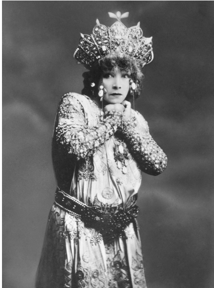
Paul Boyer, Sarah Bernhardt in Victorien Sardou's Théodora 1902, gelatin silver bromide print