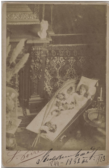
Sarah Bernhardt sleeping in her coffin

c. 1880, Paris