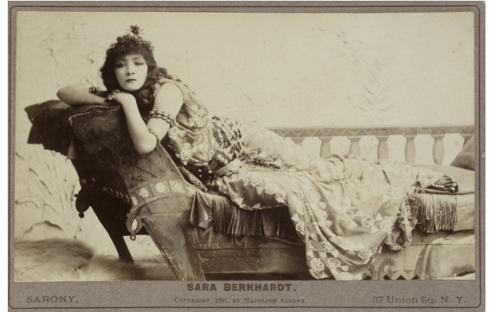
Napoléon Sarony, Sarah Bernhardt in Cléopâtre 1891, Musée d'Orsay