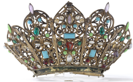
-Anonymous, Headdress for Theodora c. 1884, copper alloy, coloured glass cabochons, Palais Galliera, Musée de la Mode de la Ville de Paris