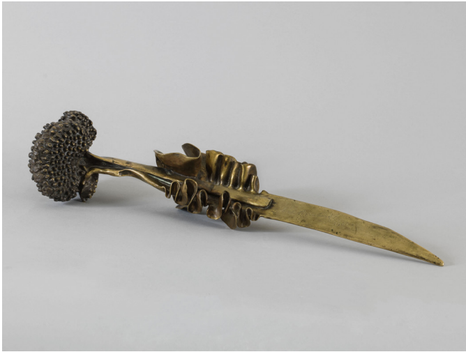
Sarah Bernhardt, Algues 1900, bronze, Paris, Petit Palais, Musée des Beaux-Arts de la Ville de Paris

During her stays on Belle-Île, Sarah Bernhardt collected seaweed, fish and shells which she then had moulded in plaster and cast in bronze. She thus created spectacular sculptures, entirely in the spirit of Art Nouveau, which she exhibited at the 1900 Universal Exhibition. Several bronze seaweeds are presented here, along with photographs documenting some of her creations that are now lost - such as this strange fountain in the shape of an imaginary fish.