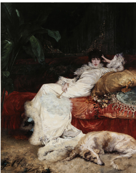
Georges Jules Victor Clairin, Portrait of Sarah Bernhardt 1876, oil on canvas, Petit Palais, Musée des Beaux-arts de la Ville de Paris, Paris, France

In April 1879, Sarah Bernhardt took over the role of the Queen at the Comédie-Française, seven years after her triumph at the Odéon theatre. The painter Georges Clairin, Sarah Bernhardt's lover and later faithful friend, portrays the actress in the 1879 production, wearing a dress with a high collar that flatters her graceful figure. A small crown nestles in her curly hair: it recalls the «small open-work silver diadem» that enchanted Théodore de Banville in 1872 ( Camées parisiens , 1875).