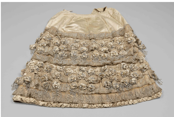
Skirt worn by Sarah Bernhardt in Frou Frou BnF, Department of Performing Arts, Paris, France

Without enjoying any exclusive rights, Paul Nadar, Félix's son, built up a body of images between 1876 and 1894 that illustrates Sarah's social life and her repertoire in the theatre. In the role of Macbeth, he emphasised the expression on the actress' face which, in L'art du théâtre , reminds us that the actor «must give the audience the reality of a being who, for him, is only fiction. He must, with his own eyes, shed the tears of the other. With his own voice he must cry out the pain of the other. His own heart beats wildly, because it is the other's heart that beats in him. And when he comes out of a tragic or dramatic scene, the artist, if he has rendered his character with success, must be panting and spent.»