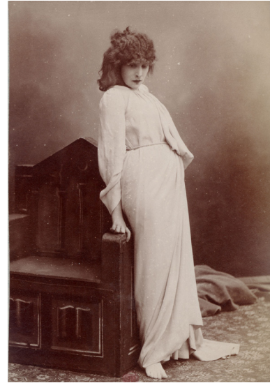
Paul Nadar, Sarah Bernhardt as Macbeth 1884, photograph, BnF, Département des Estampes et de la photographie, Paris, France

Canadian-born Napoleon Sarony opened his first studio in New York in 1865. A renowned portraitist, he obtained the exclusive rights to take Sarah's portraits in America by offering her the sum of $1,500. The actress poses in her Frou Frou stage costume, in a setting created in the photographer's studio. Curiously, she is standing in front of a photograph of a young woman placed on a stand. It is not clear if the portrait is one of the photographer's props or whether it had special significance for Sarah.