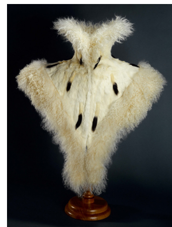
Medici collar that belonged to Sarah Bernhardt with a border in ermine, trimmed in white lambskin and lined in satin.

c. 1900, silver print, Paris, Musée d'Orsay