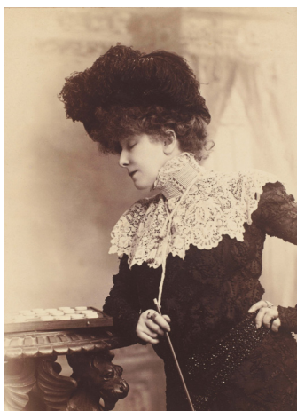
Madame Sarah Bernhardt

c. 1900, silver print, Paris, Musée d'Orsay