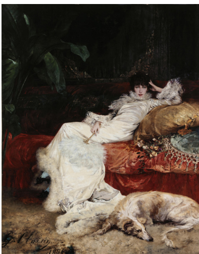
Georges Jules Victor Clairin, Portrait of Sarah Bernhardt, 1876, oil on canvas

During the 1870s, Sarah Bernhardt lived surrounded by artists, including the painters Alfred Stevens, Gustave Doré, and Jules Bastien-Lepage. Met in the early 1870s, Georges Clairin and Louise Abbéma held a special place in this circle of artists. Both were in love with and fascinated by Sarah Bernhardt and strove to represent the actress on stage and in her private life. At the 1876 Salon, they both exhibited a portrait of Sarah: Abbéma depicted her dressed for town, while Clairin showed her at home, in a sumptuous white negligee that showed off her supple and sinuous figure to perfection. Much noticed at the Salon, this large portrait, one of the jewels of the Petit Palais collection, is now one of the most famous ones of the actress. Influenced by her friends, Sarah Bernhardt herself began painting and sculpting. She demonstrated real talent as a sculptor and exhibited regularly at the Salon. She also did numerous portraits. The actress liked to stage her sculptures and often had a spectacular studio-living room built where Parisians from artistic and socialite circles could come and admire her creations.