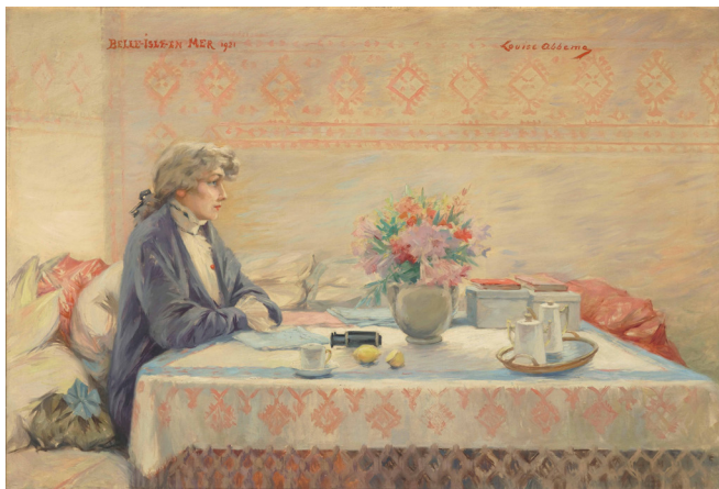
Louise Abbéma, Portrait of Sarah Bernhardt 1921, oil on canvas, Musée d'Orsay, Paris