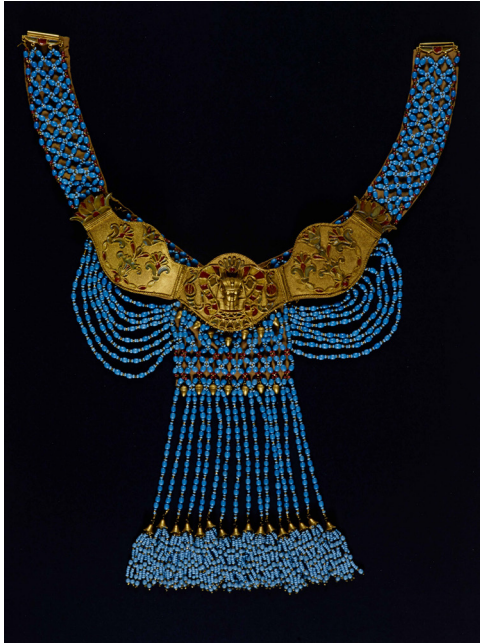
Anonymous, Cleopatra pectoral c.1890, gilt metal, turquoise pearls and stones, coral stones, white pearls