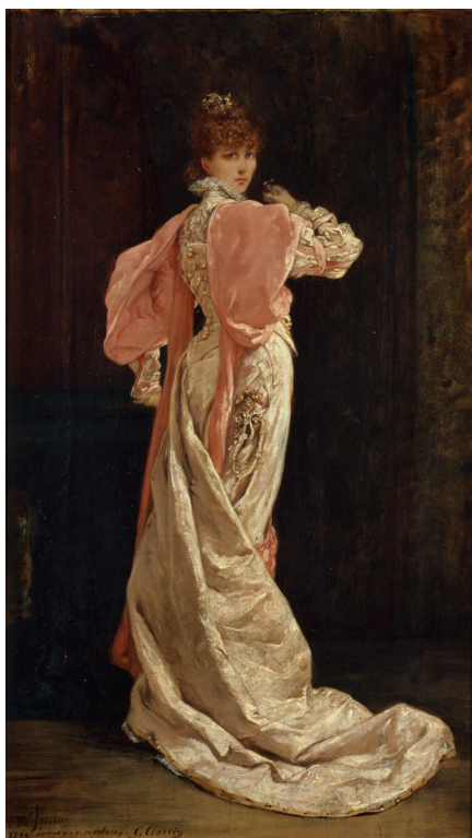
Georges Clairin, Sarah Bernhardt in the role of Dona Maria de Neubourg, in Ruy Blas by Victor Hugo, 1879, oil on canvas, Comédie-Française, Paris