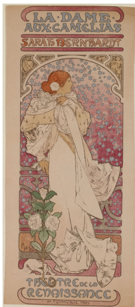
Alphonse Mucha, La Dame aux camélias

At the end of 1894, the young Alphonse Mucha, still unknown, was commissioned to design a poster for Victorien Sardou's play Gismonda , in which the title role was played by Sarah Bernhardt. The poster, posted in Paris on 1 January 1895, was an immediate success and made Mucha famous. The artist became one of Sarah Bernhardt's favourites and produced a total of six posters featuring her in a monumental format. These six posters, collected for the exhibition, are all presented in this gallery.