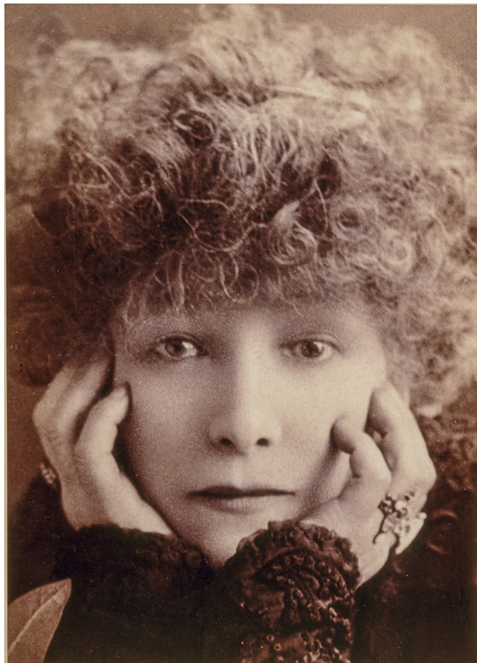
W.& D.Downey, Sarah Bernhardt in close-up, 1902, album card, Paris

Information and booking: petitpalais.paris.fr