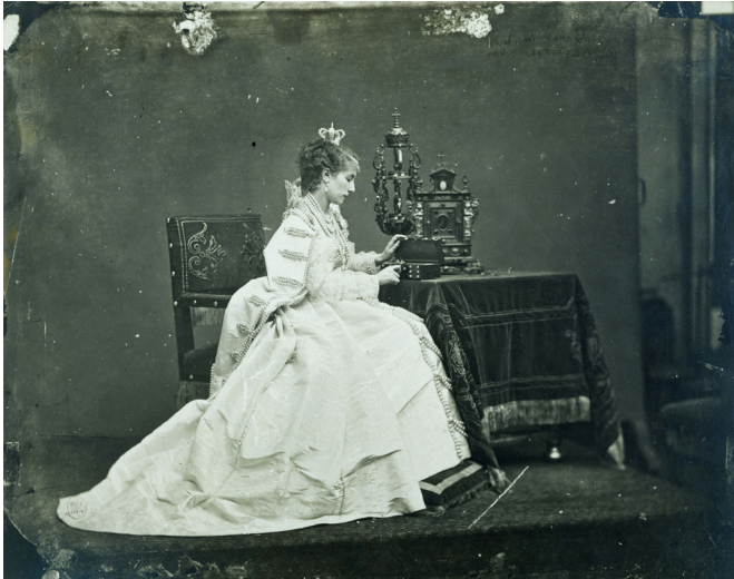
Etienne Carjat, Sarah Bernhardt as Dona Maria de Neubourg in Victor Hugo's Ruy Blas

1872, photograph, Musée Carnavalet, Paris, France