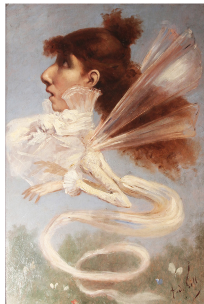
André Gill, Sarah Bernhardt as a chimera

When Otto Wegener, a photographer of Swedish origin, moved to Paris in 1867, he dropped his last name and went by simply "Otto". A renowned portraitist and competitor of Nadar and Reutlinger, among others, he made several portraits of Sarah. Here, she is wearing an astonishing bat hat that evokes the collection of poems, Les Chauves-souris , that her very good friend, the Count de Montesquiou, had published in 1893. That year, she recited a few extracts from the work during a morning poetry reading. The work inspired the creation of new objects, letterhead, tie pins, crystal vases and women's fashion.