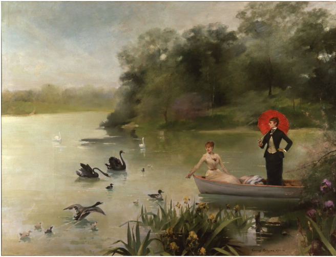
Louise Abbéma, Sarah Bernhardt and Louise Abbéma on the lake in Bois de Boulogne 1883, oil on canvas, Comédie-Française, Paris

Louise Abbéma met Sarah Bernhardt in the early 1870s, when she was starting her career as a painter. She immediately fell under Sarah's spell: this was probably the beginning of a love affair with the actress, and the two remained close friends for the rest of Sarah's life. This large painting, which shows the two women in a rare moment of relaxation, during a boat ride in the Bois de Boulogne, is a discreet tribute to their relationship.