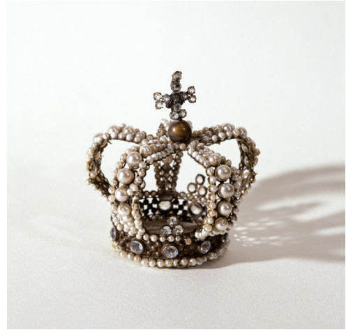
Anonymous, the Queen's crown worn by Sarah Bernhardt in the role of the Queen in Ruy Blas , 1879, Copper and silver alloy, tulle, pearls, rhinestone, Comédie-Française, Paris

W.& D.Downey, Sarah Bernhardt in close-up , 1902, album card, Paris © BnF