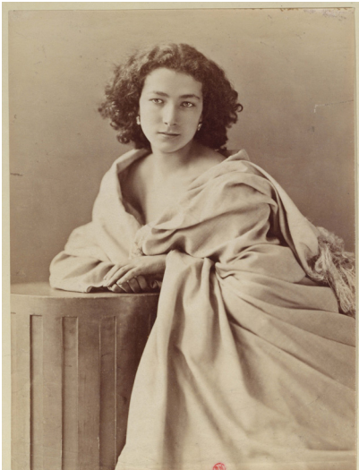
Félix Tournachon, known as Nadar, Sarah Bernhardt draped in white 1859, albumen print, BnF, Département des Estampes et de la photographie, Paris, France

Sarah Bernhardt was not a well-known name when Félix Nadar took this series of three portraits. They date to either 1859 or 1864, depending on the collections where they are kept. This one is probably from the earlier date, judging from how young the actress is, her unruly hair, and sober setting, which is reminiscent of Nadar's earliest portraits. Indeed, the photographer turned his attention entirely on his models' faces; the decor was of little importance.