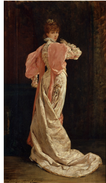
Georges Clairin, Sarah Bernhardt in the role of Dona Maria de Neubourg, in Ruy Blas by Victor Hugo 1879, oil on canvas, Comédie-Française, Paris

Sarah Bernhardt was not a well-known name when Félix Nadar took this series of three portraits. They date to either 1859 or 1864, depending on the collections where they are kept. This one is probably from the earlier date, judging from how young the actress is, her unruly hair, and sober setting, which is reminiscent of Nadar's earliest portraits. Indeed, the photographer turned his attention entirely on his models' faces; the decor was of little importance.