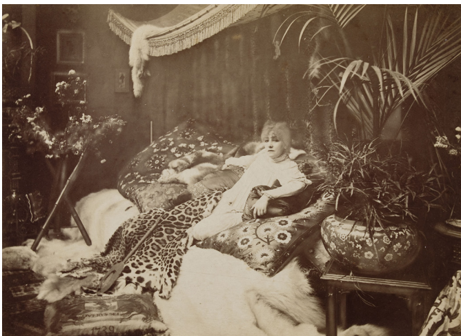
Félix Tournachon, known as Nadar, Sarah Bernhardt at home

This magnificent watercolour depicts the studio-salon of Sarah Bernhardt's private mansion, built in 1875 by the architect Nicolas-Félix Escalier in the fashionable district of the Plaine Monceau. This spectacular studio, which also served as a reception room where the actress received guests, was at the heart of the mansion. Palm trees, animal skins and works of art are mixed together in an artistic bric-a-brac, typical of wealthy studios of the time.