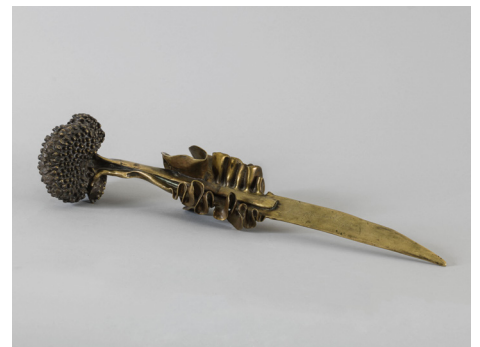
Sarah Bernhardt, Algues, 1900, sculpture en bronze