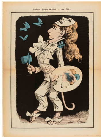
André Gill, Sarah Bernhardt as a Sphinx , painter and sculptor

published in La Lune rousse , n°96, 6 October 1878, Musée Carnavalet, Paris, France of the light in a more or less impressionistic fashion.