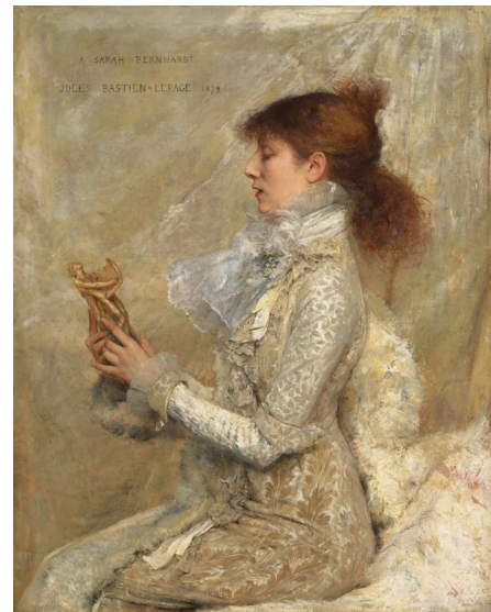
Jules Bastien-Lepage, Portrait of Sarah Bernhardt 1879, private collection